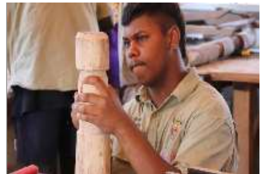
Pictured: Pukamani Project