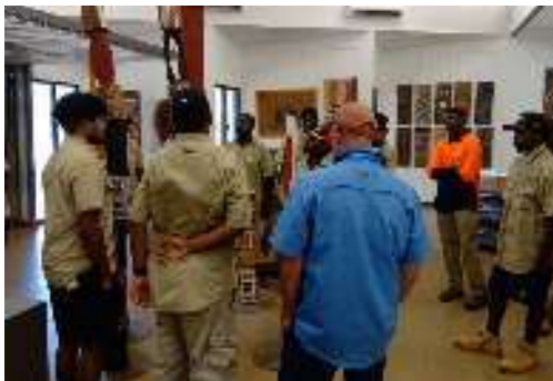
Pictured: Pukamani Project