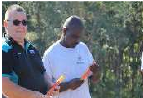
Pictured: Flare Practice