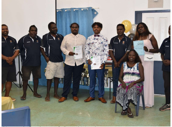
Pictured: Graduates & Board Members