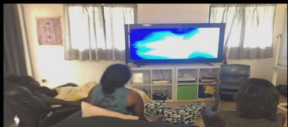
Enjoying their large screen TV which they purchased with all their well-earned Fete money from last year.

Life Skills: This term for Life Skills we have focused on seeing our girls take more responsibility with the daily running of the Family Group Home. They are washing their clothes, are involved in more clean up, and helping prepare dinners. We believe they will leave Tiwi College equipped with a wide range of skills necessary for the running of their own homes.