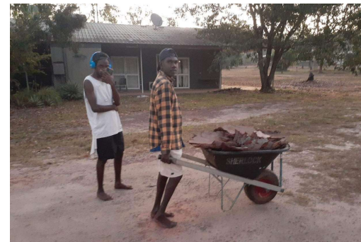
Pictured: Life Skills