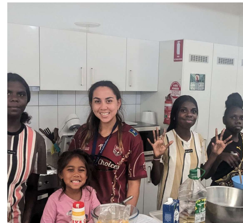
Pictured: Cooking & Taste-Testing