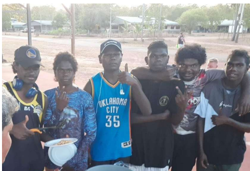
Pictured: Community Dinner