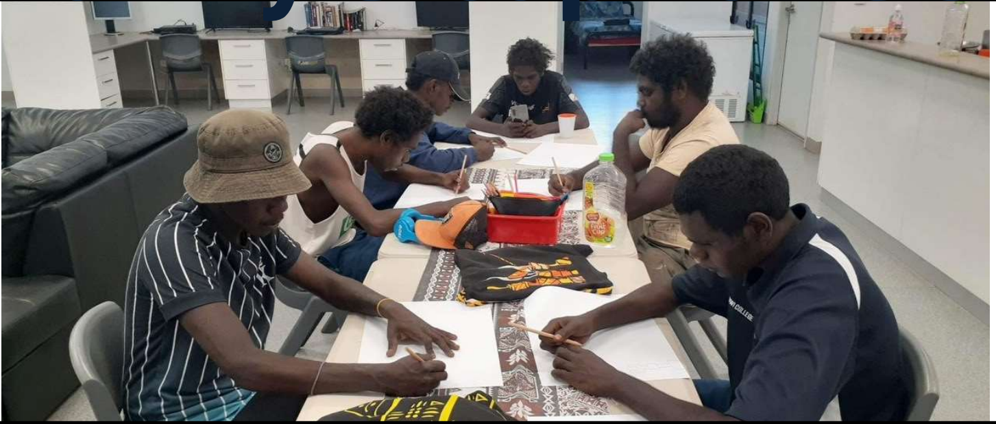
Pictured: Fete Preparation - Arts & Crafts