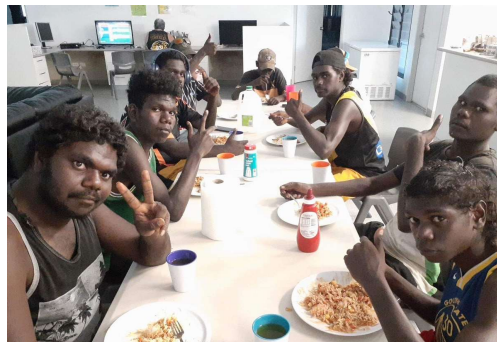
Pictured: Family Dinner