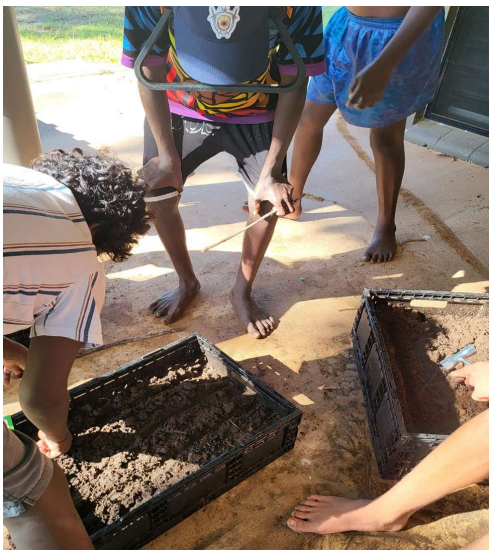
Pictured: Veggie Garden