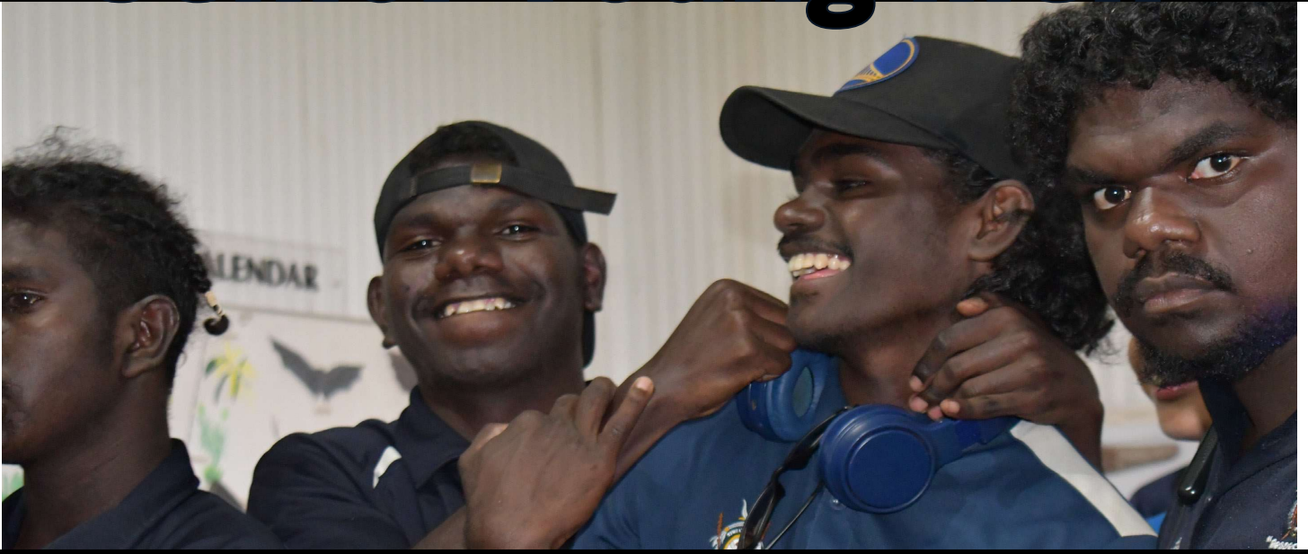
Pictured: Senior Young Men Class

This has been an extremely productive semester for all students in the Senior Young Men's class. Firstly, we have been using the BSKB literacy and numeracy materials to progress in these necessary skills. We have done this at our own pace, whilst addressing the individual needs of every student. This has been extremely successful in allowing every learner an opportunity to progress at his own level and need.