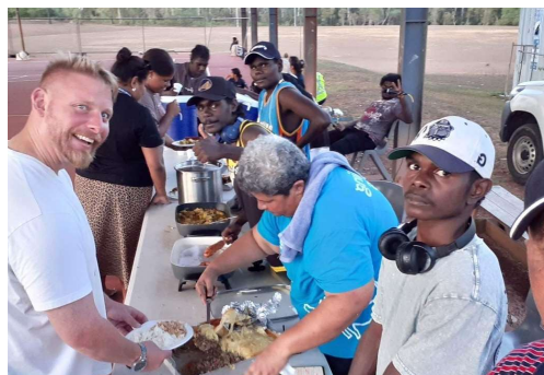
Pictured: Community Dinner