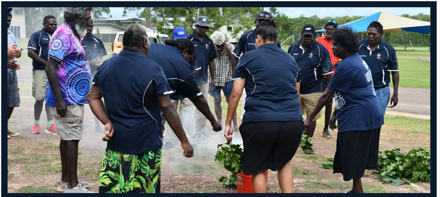
Pictured: Kumurrupuni Ceremony