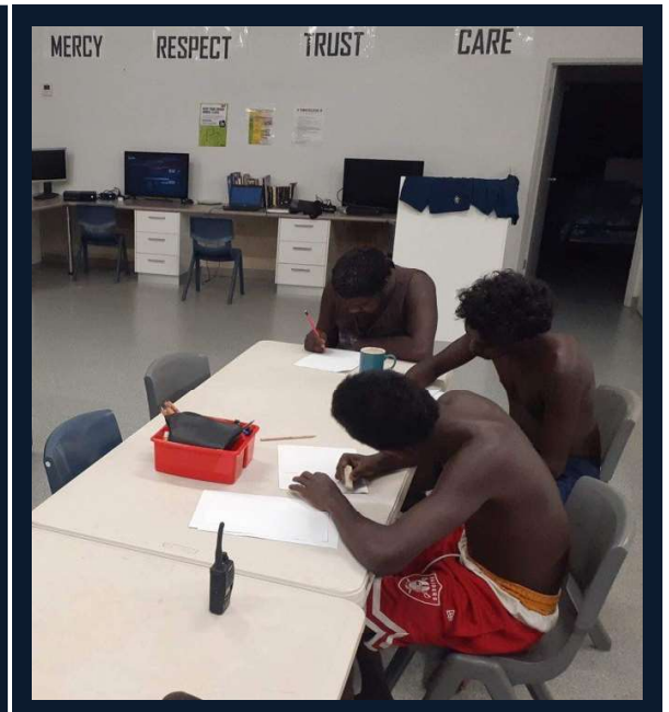
Pictured: Evening bonding by bonfire, storytelling, academy and homework.