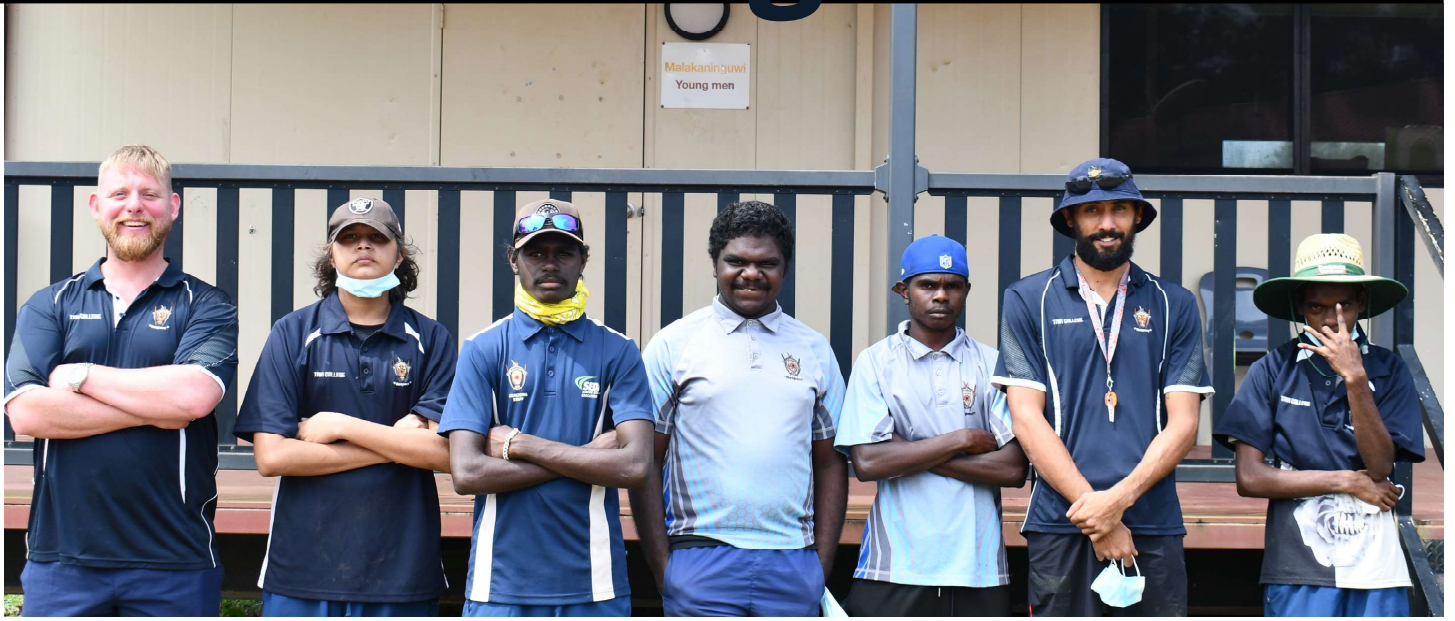
Pictured: Senior Young Men Class